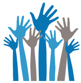
300+ offer to volunteer for the campaign

Adequate space to meet the needs of our growing parish continues to be the primary challenge we face. To meet our current and future needs, Domus Studio Architecture has been chosen to develop plans for the project. Domus has long been recognized for their extensive sacred architecture experience represented by hundreds of sacred facilities throughout Southern California and the Southwestern United States. They have been tasked with drawing up plans that will accomplish the following: